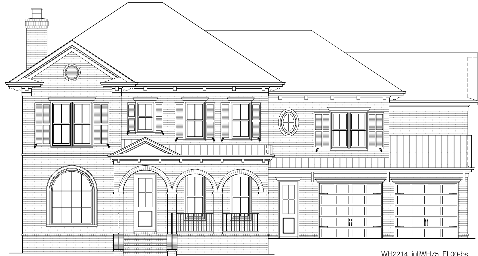
1 FRONT ELEVATION 1/8" = 1'-0"