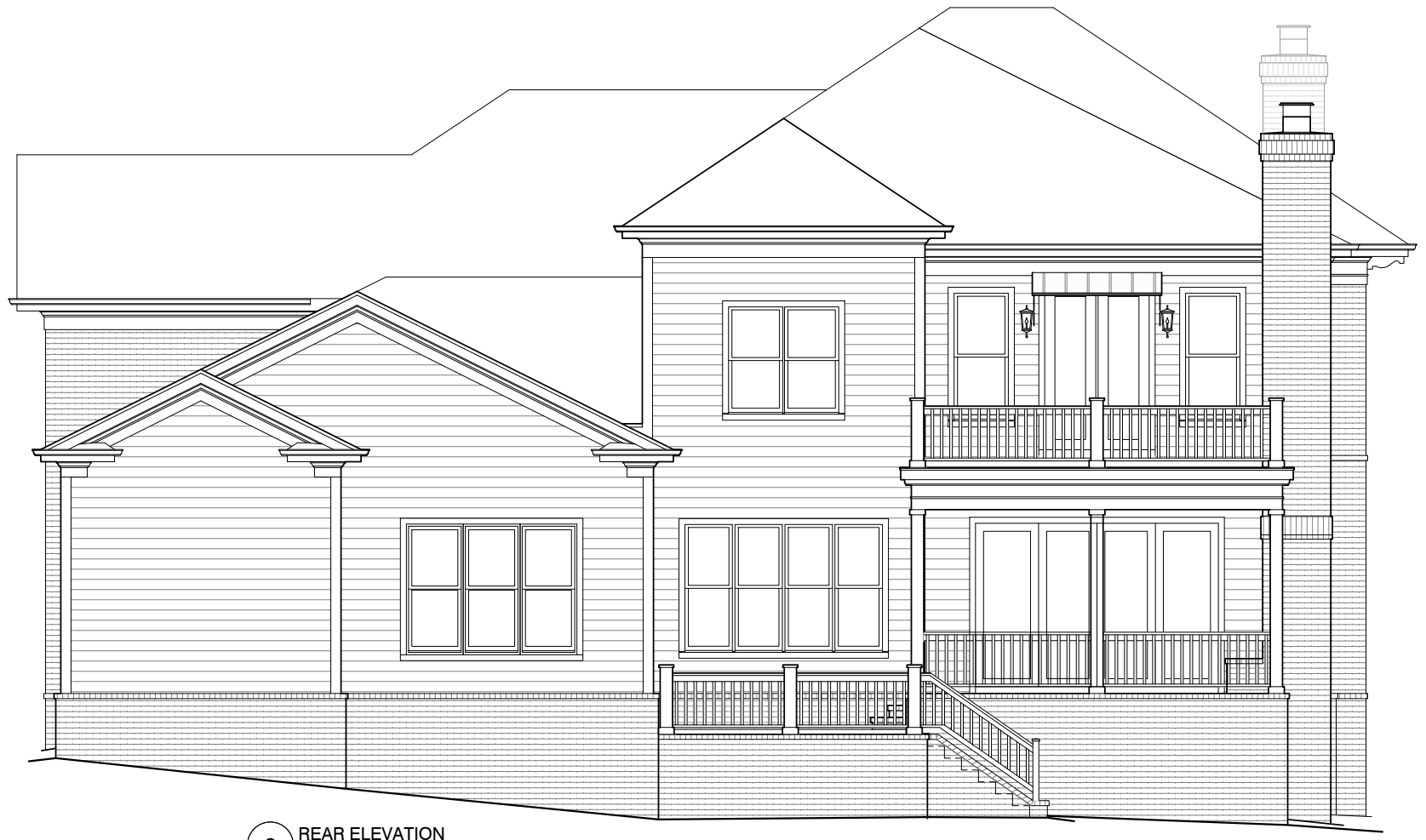
2 REAR ELEVATION 1/8" = 1'-0"