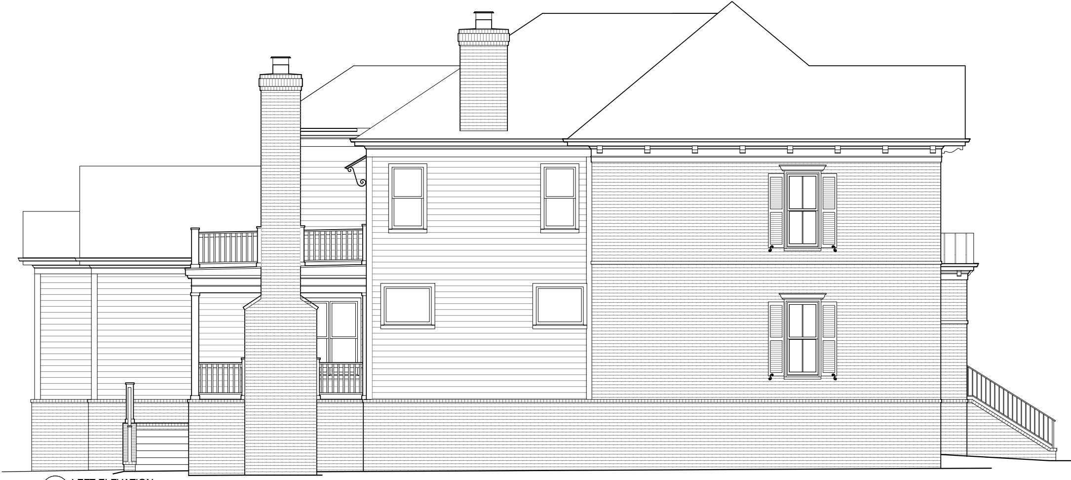
1 LEFT ELEVATION 1/8" = 1'-0"