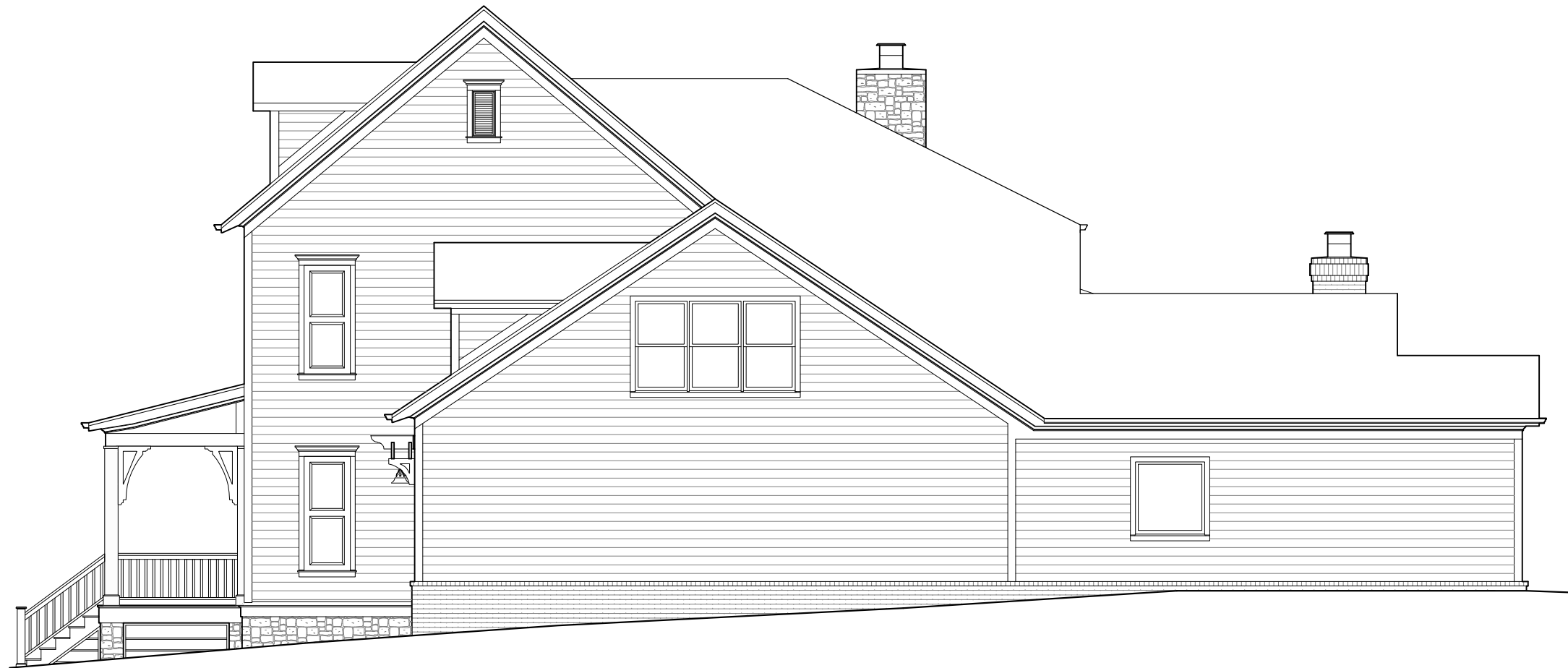
2 RIGHT ELEVATION 1/8" = 1'-0"