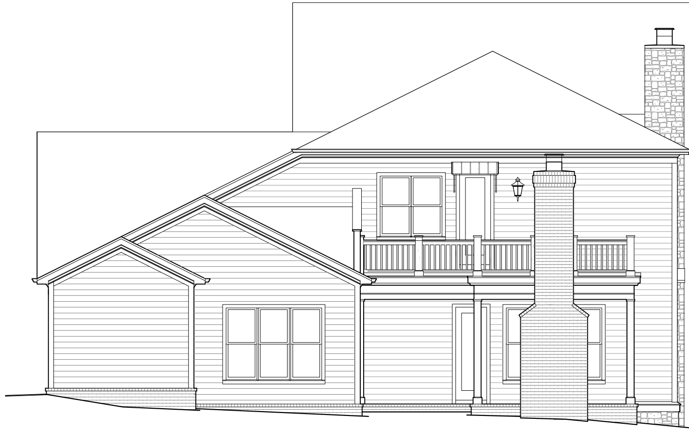
2 REAR ELEVATION 1/8" = 1'-0"