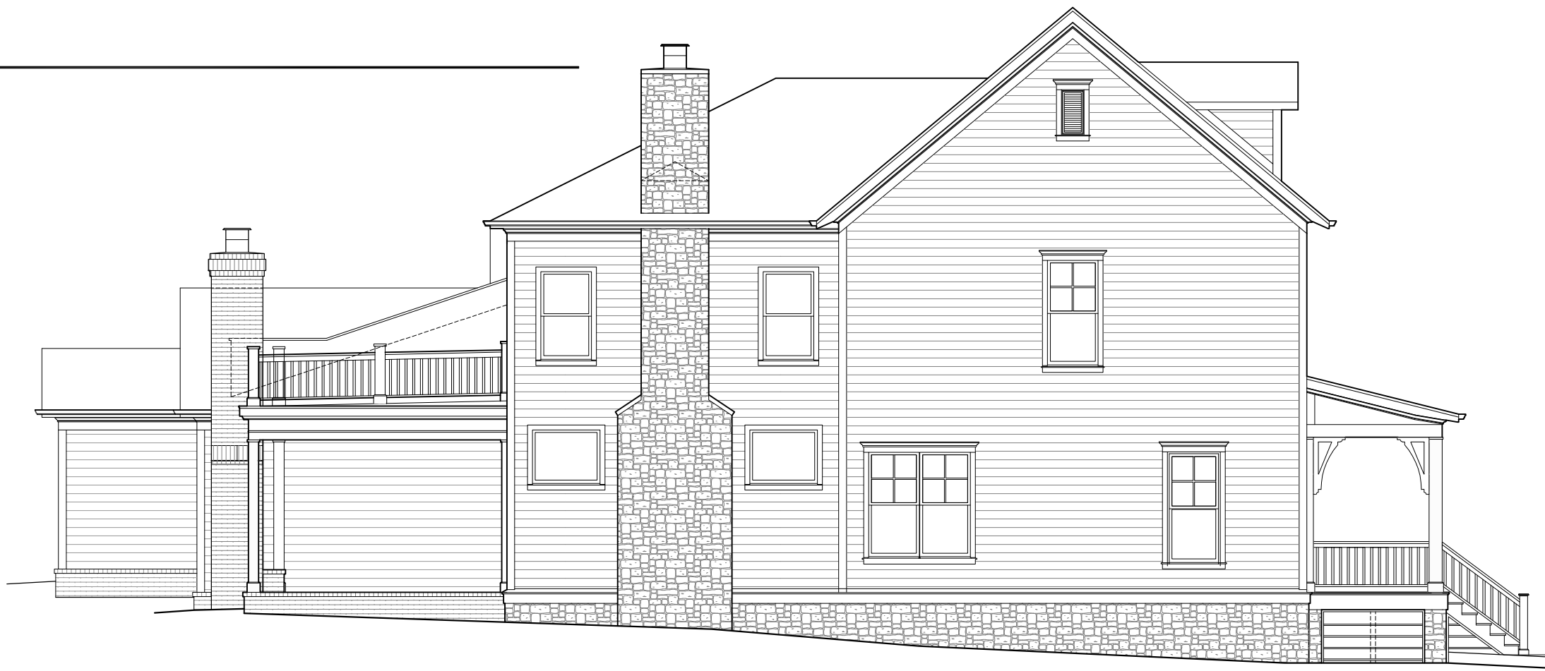
1 LEFT ELEVATION 1/8" = 1'-0"

WESTHAVEN LOT 2226 843 STONEWATER BLVD. CAMILLE 65 WH2226_camiWH65 LAST CHECKED: 09.28.2021 KTD