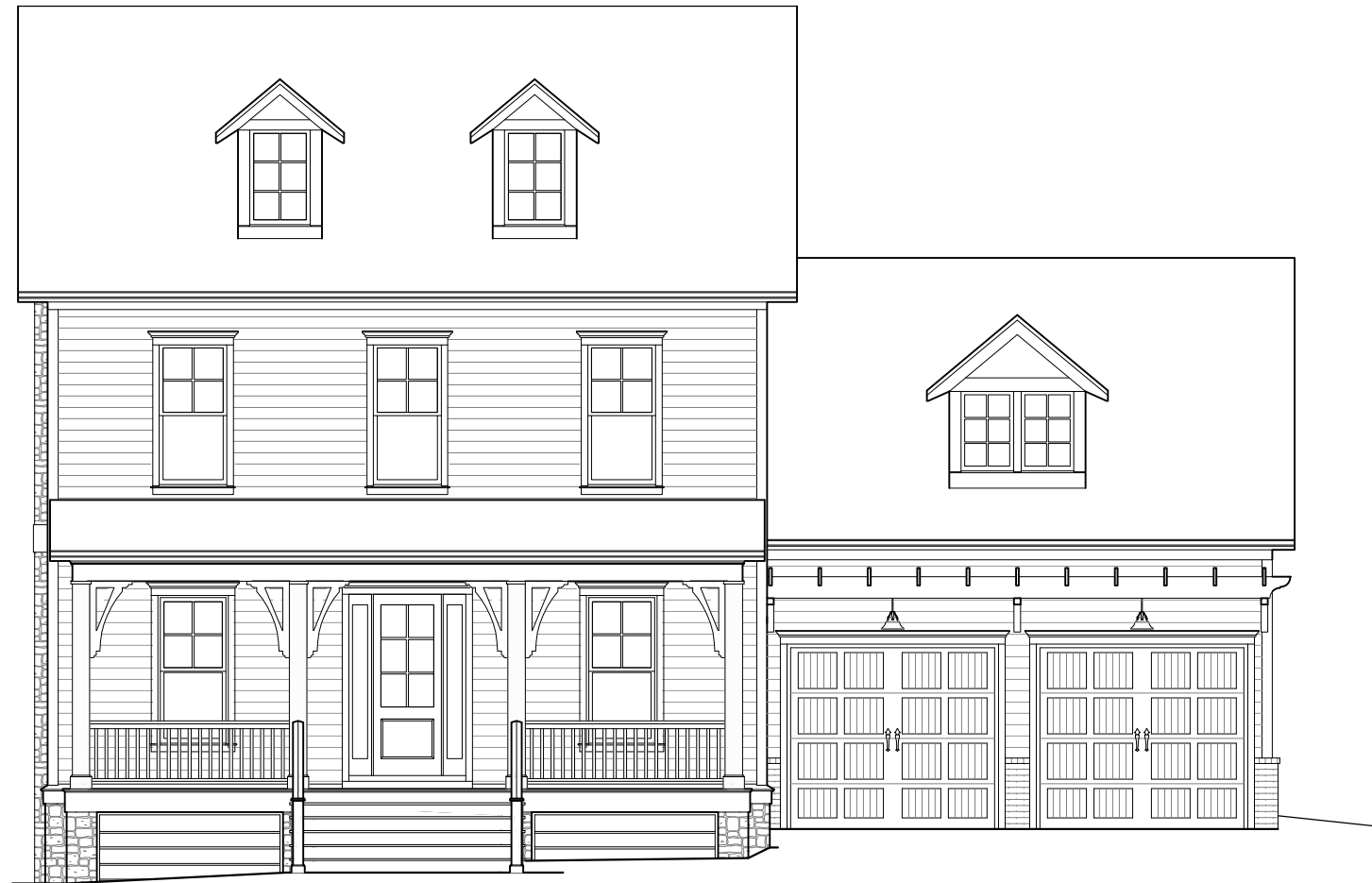
1 FRONT ELEVATION 1/8" = 1'-0"