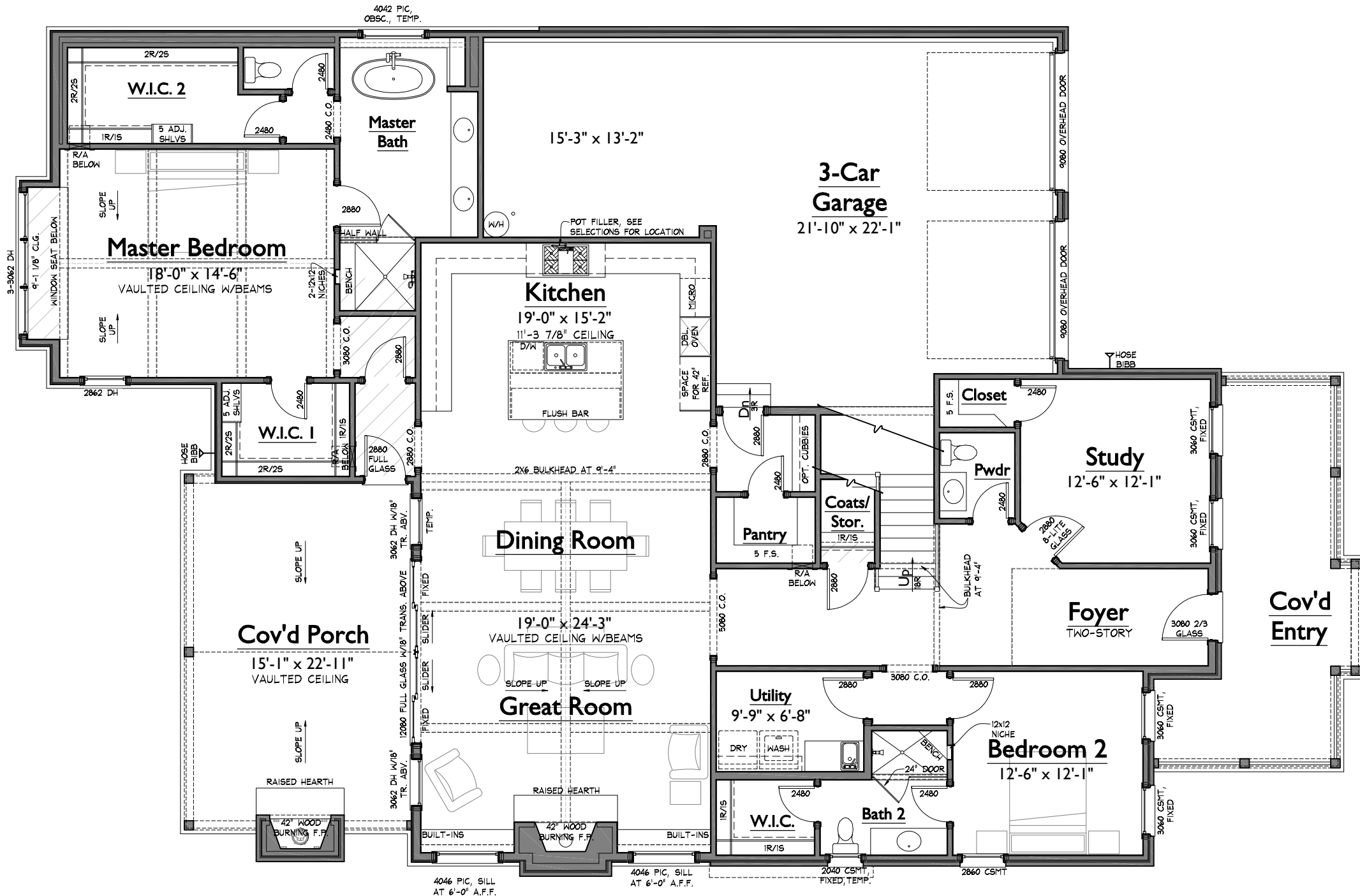
1 LOWER LEVEL FLOOR PLAN 1/8" = 1'-0"