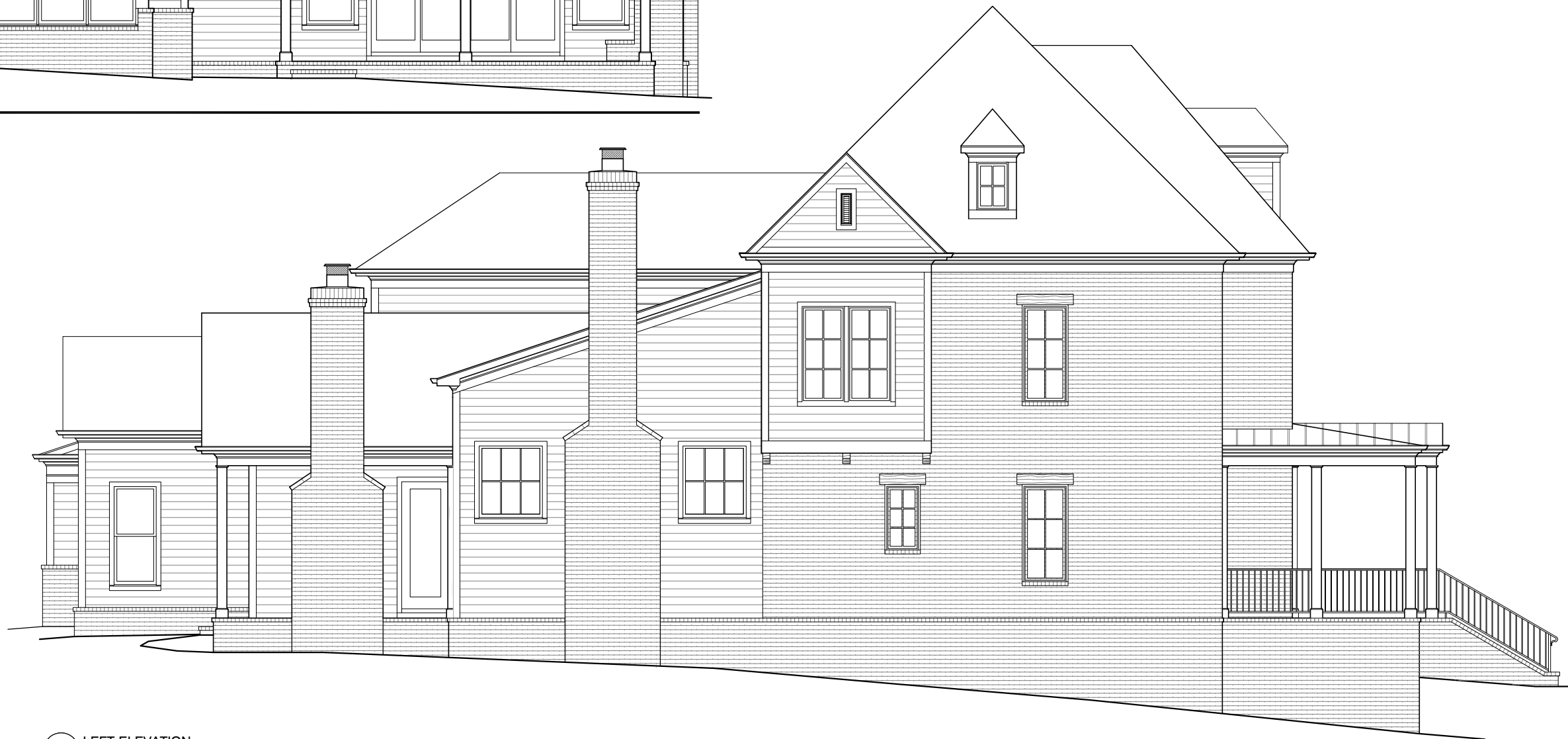
1 LEFT ELEVATION 1/8" = 1'-0"

WESTHAVEN LOT 2225 837 STONEWATER BLVD. EVERLEIGH 65