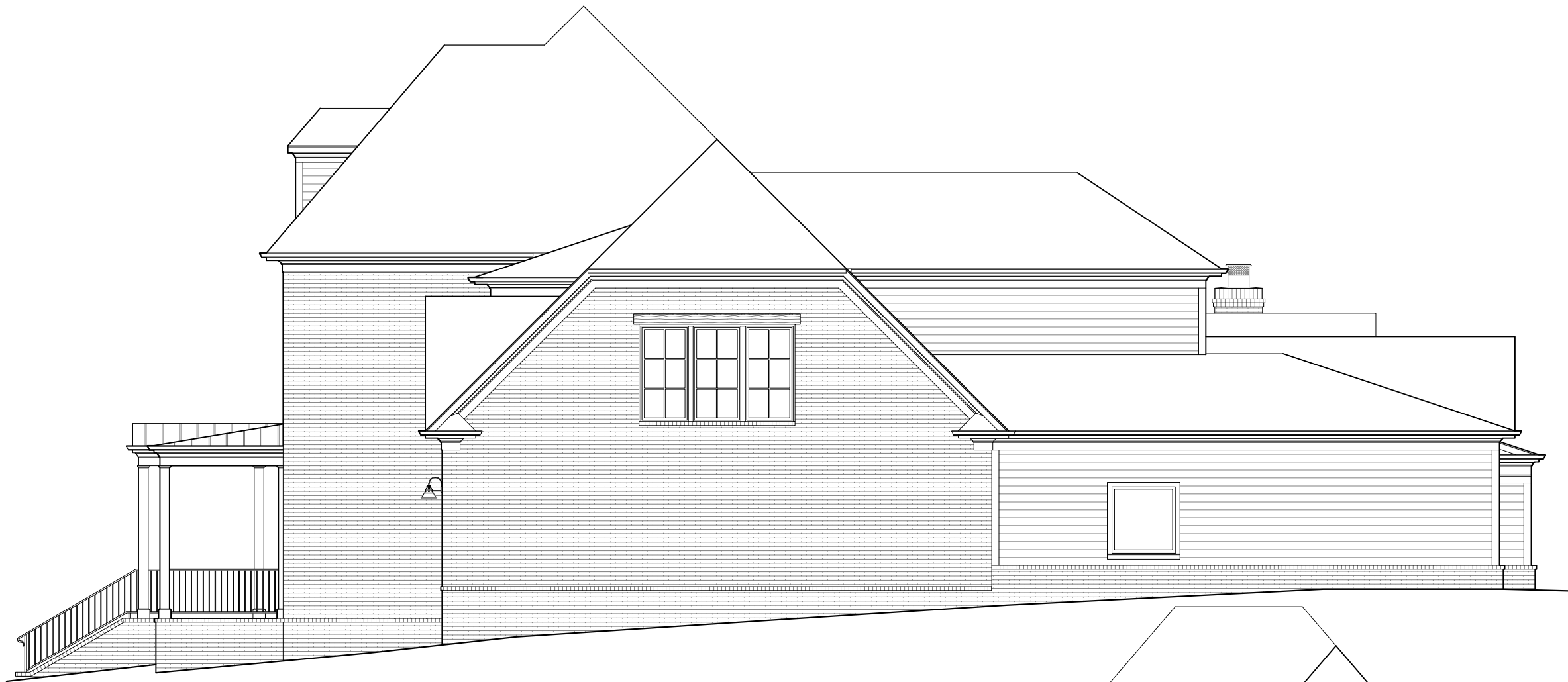
2 RIGHT ELEVATION 1/8" = 1'-0"