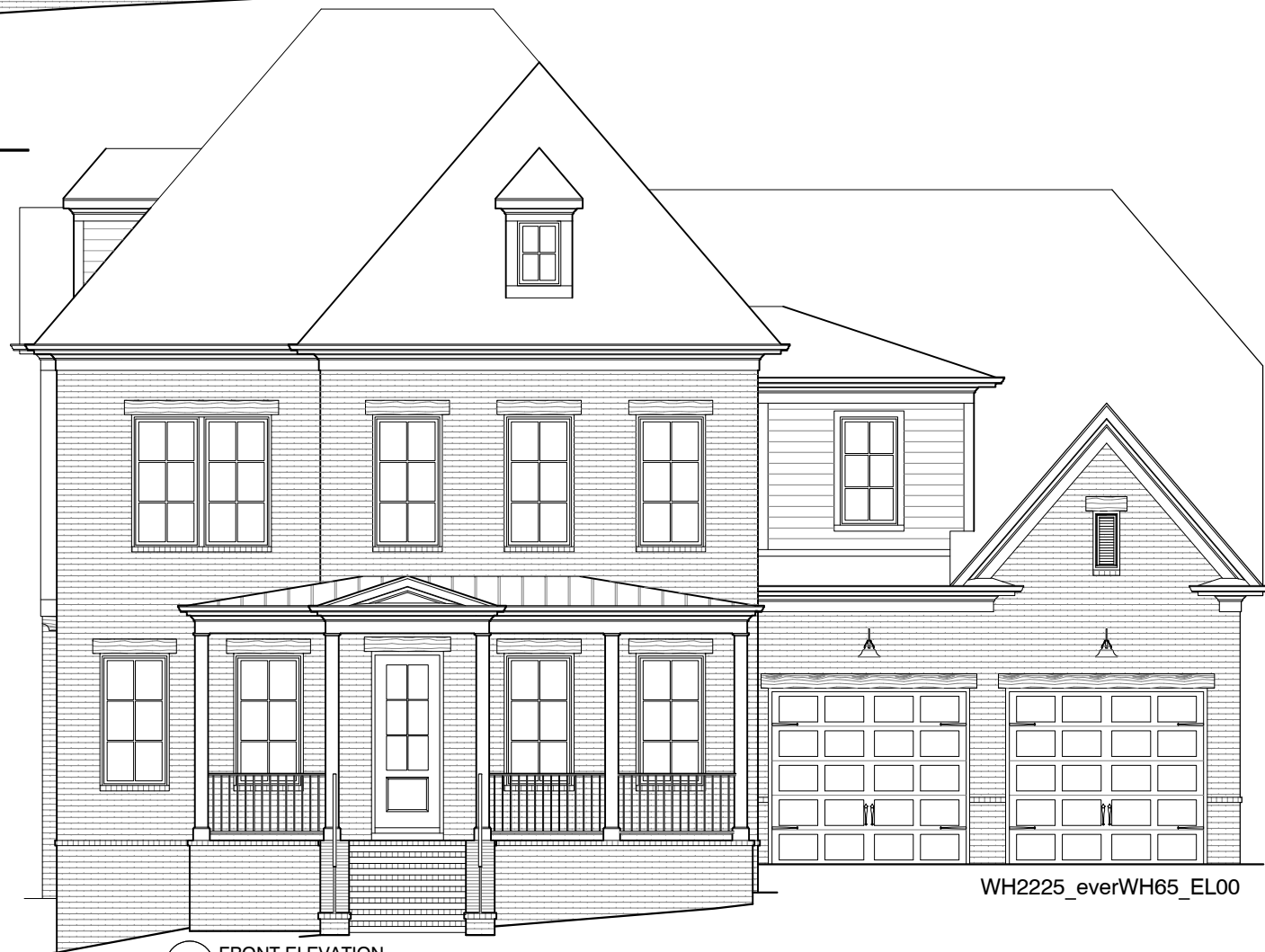
1 FRONT ELEVATION 1/8" = 1'-0"