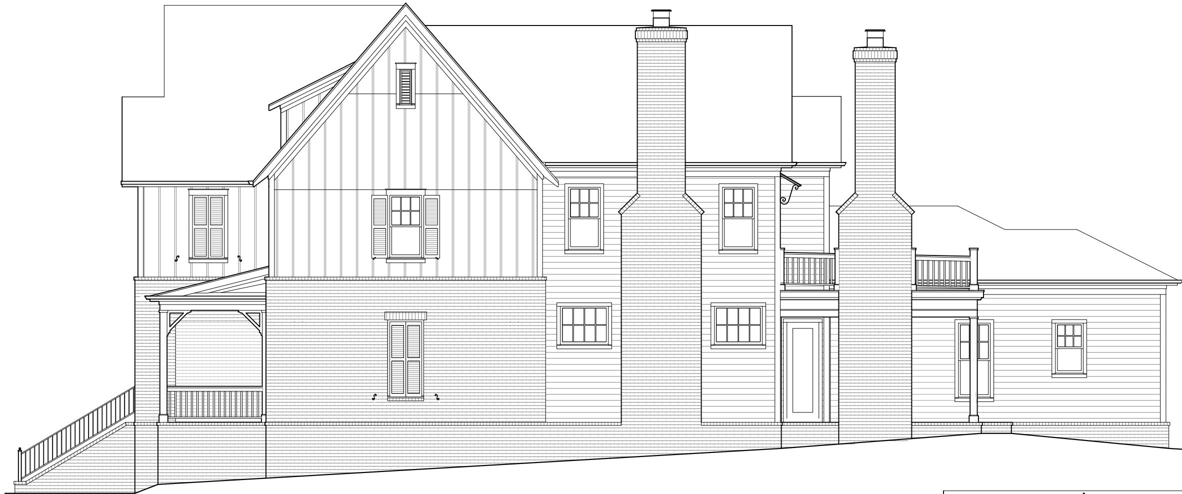
2 RIGHT ELEVATION 1/8" = 1'-0"