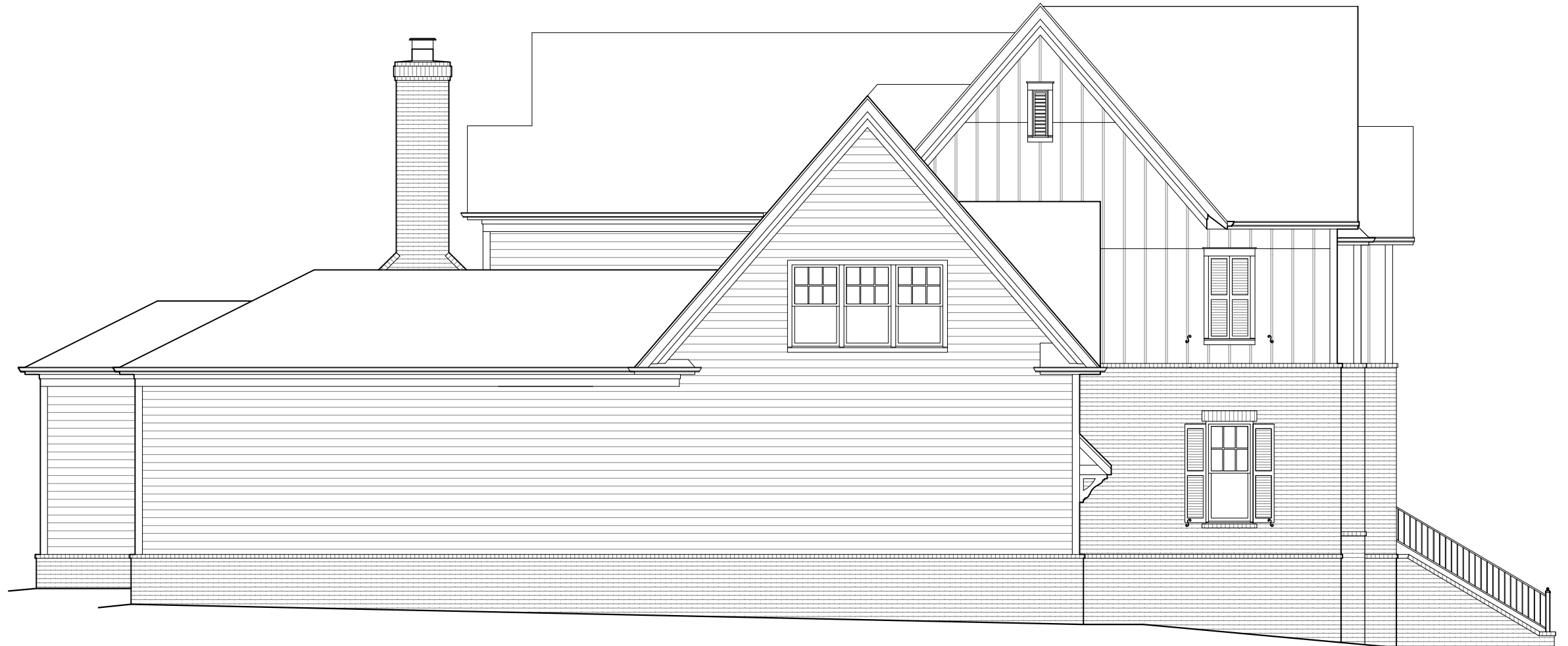
1 LEFT ELEVATION 1/8" = 1'-0"

WESTHAVEN LOT 2227 5075 KATHRYN AVENUE NATASHA 65 WH2227_nataWH65