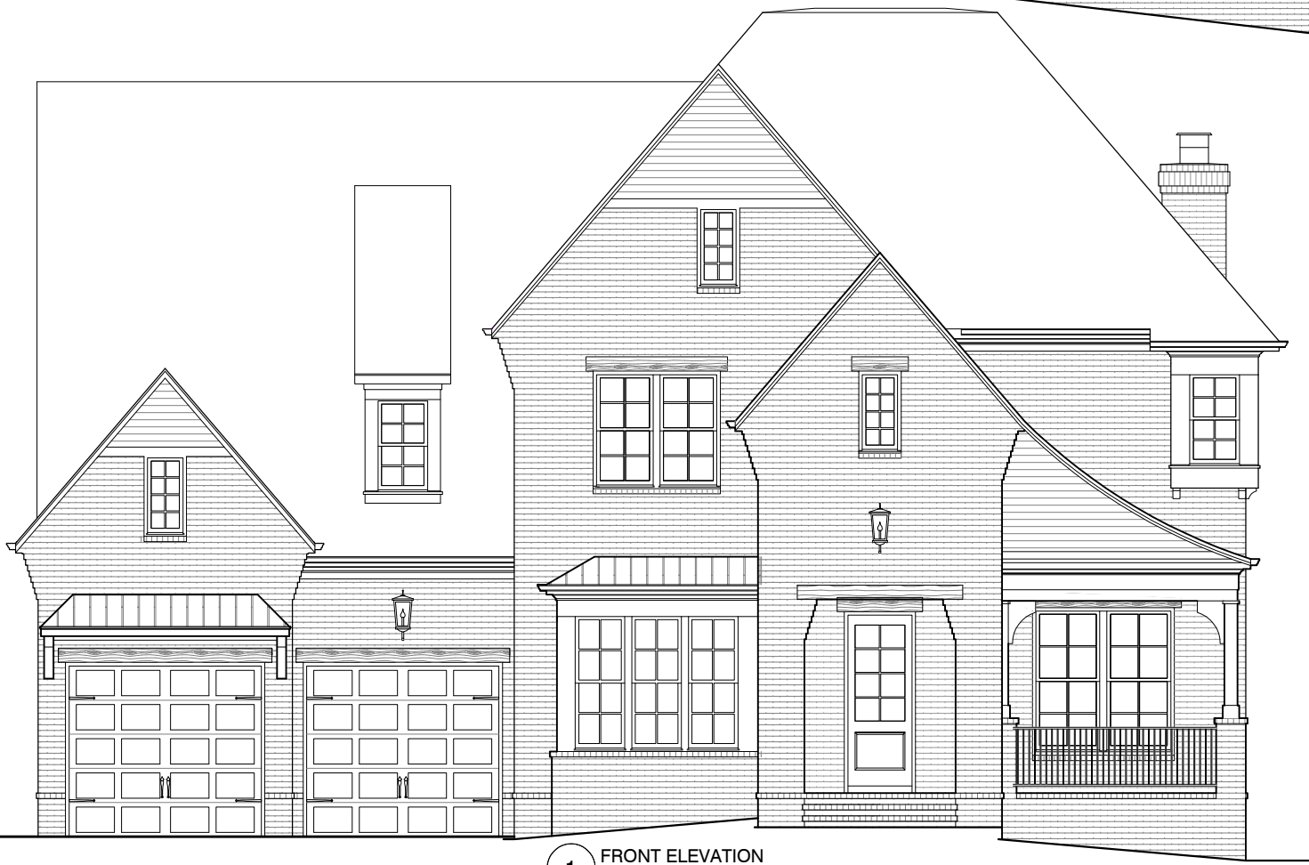
1 FRONT ELEVATION 1/8" = 1'-0"