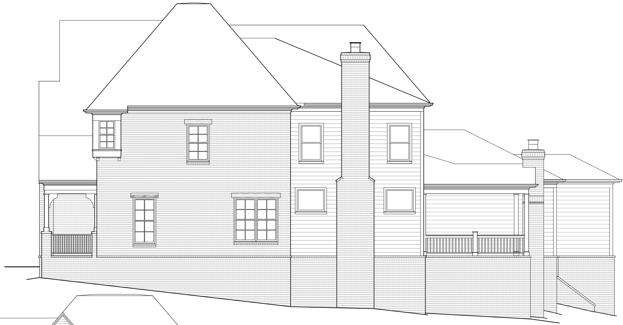
2 RIGHT ELEVATION 1/8" = 1'-0"