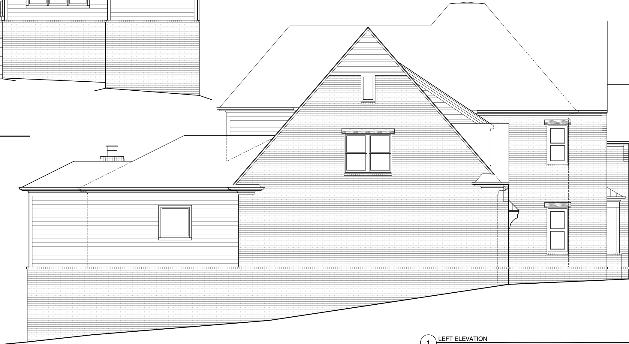
1 LEFT ELEVATION 1/8" = 1'-0"

WESTHAVEN LOT 2256 5068 KATHRYN AVENUE CAMILLE 65' CUSTOM