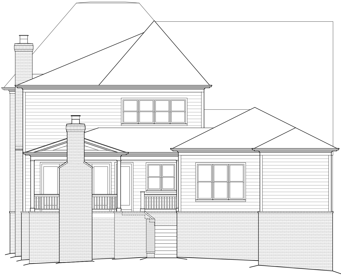
2 REAR ELEVATION 1/8" = 1'-0"